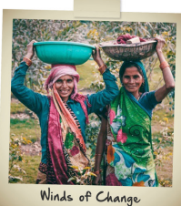
Winds of Change